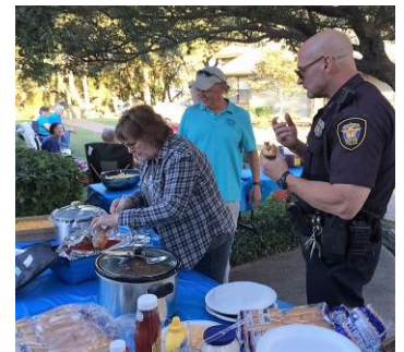
Chili Dogs and Good Food