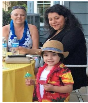
Just havin' fun at the Luau