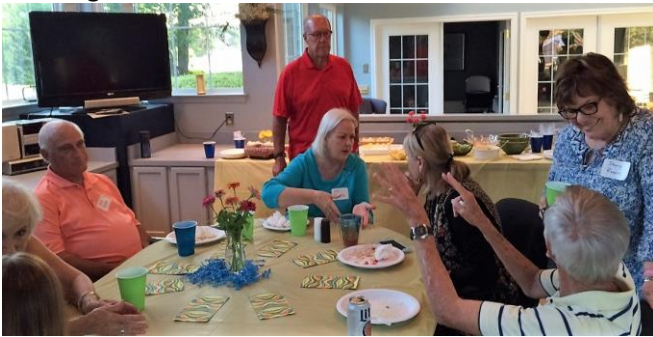
“Meet & Greet” - A time to get to know your Neighbors

Since the temperatures were so hot (you do remember?), The Landing had a “Meet-and-Greet-Bring-a-Salad-to-Share” Night on August 22 in the air conditioned clubhouse. It was well attended and people really had a chance to visit with everyone. The Meet-and-Greets are a good way to start to get to know our neighbors.