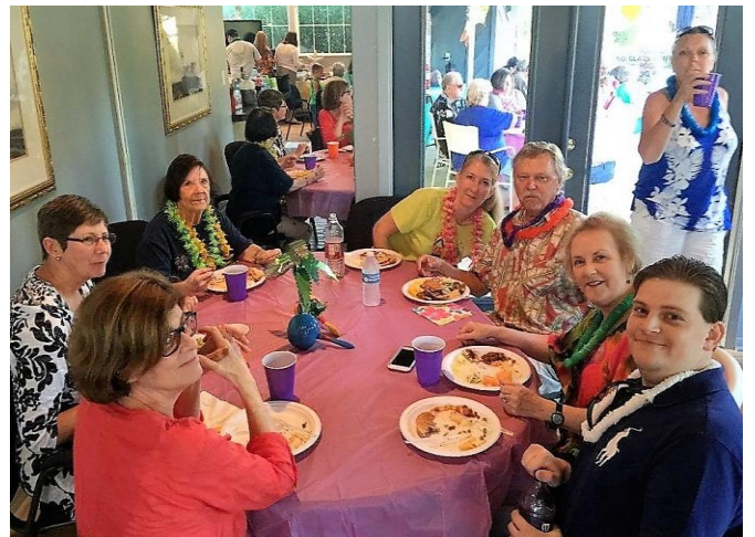
Luau Party - Lotsa Food and Fun