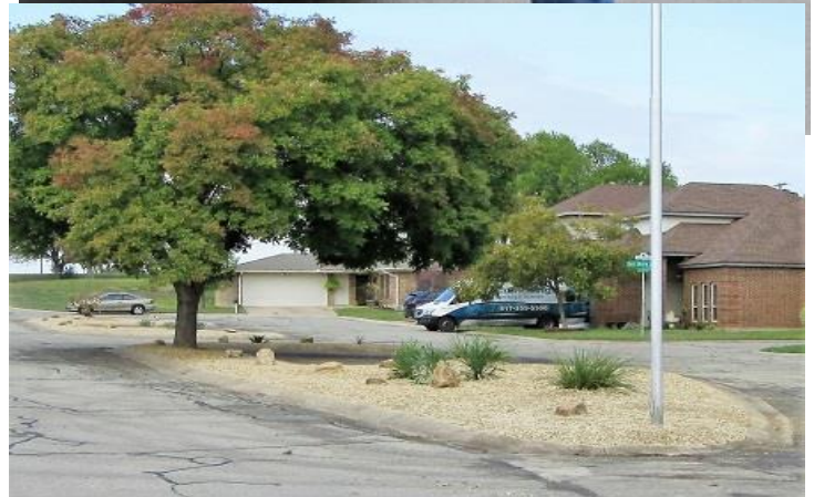
The Landing ... it's a way of LIFE!