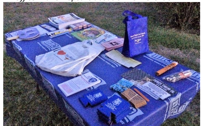
Crime, Safety and Environmental Materials