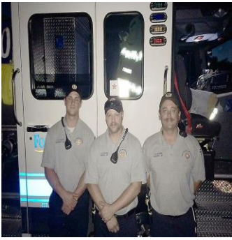
Fire Engine #40 Crew