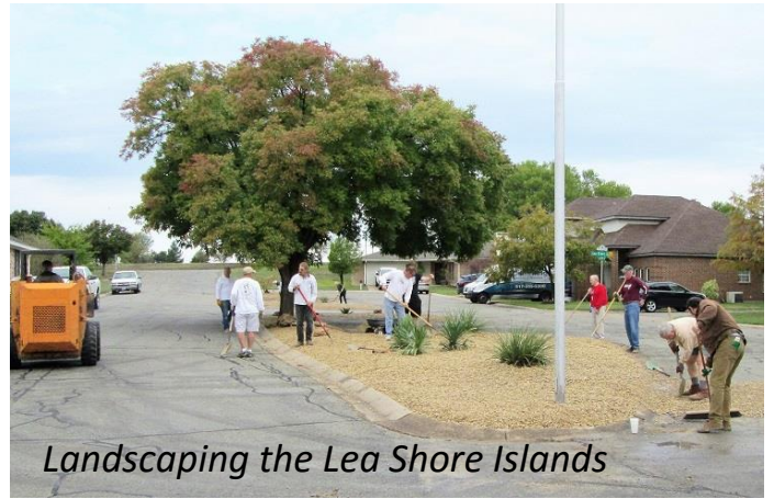
Landscaping the Lea Shore Islands